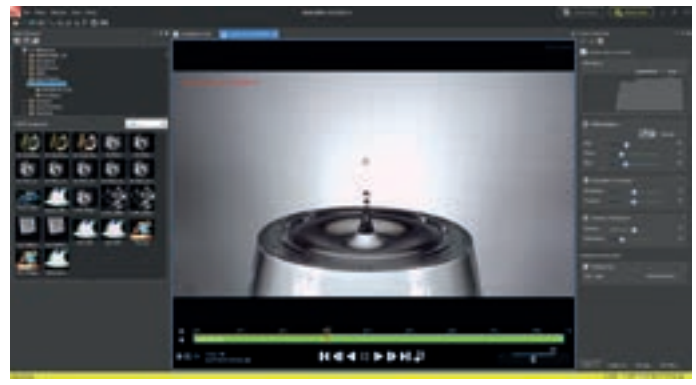
Comprehensive\ editing-\ and\ export\ function\ of\ the\ recorded\ sequence\ with\ Imaging\ Studio\ v4\ Movie Suite