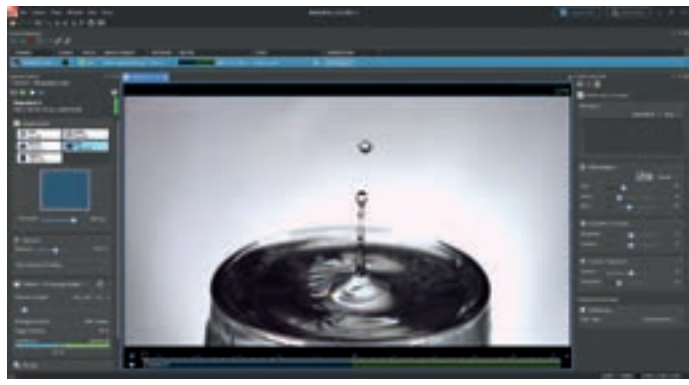
Complete \ graphical \ parametrization \ of \ the \ camera \ setting \ with \ Imaging \ Studio \ v4 \ Camera Suite

PROMON U1000 cameras are delivered with comprehensive Imaging Studio v4-software. This modern and intuitive operating software can be installed on any number of computers, in order to edit recorded sequences without a camera, convert these into other formats, or perform further analysis. If connected to a camera, all device and recording parameters can be easy and clearly set. This is software that is unmatched.